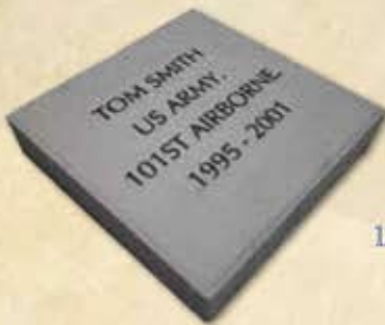
12" x 12" Paver $500