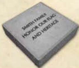
8" x 8" Paver $250