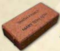
4" x 8" Paver $125